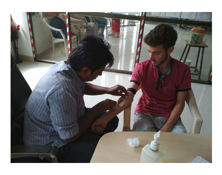
Blood Sample Testing

mester students and D2D students were made aware about Thalassaemia, its type and the effect of this blood—disorder in our life. The importance of Thalassemia testing was also elaborated as it is the only measure of preventing spreading of this disorder. An informative documentary was also shown to the students on the day before the testing and during the camp. A