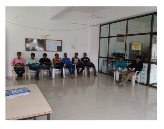
College Students Gathered for Blood Testing

A special camp was organized at Smt. S. R. Patel Engineering College, Dabhi -Unjha on 25<sup>th</sup> September 2017 (Monday) for Thalassemia Test of all the First Semester students and D2D students of the college. The camp was totally free of cost for them. The Indian Red-Cross Society—Ahmedabad was specially invited for collection of blood samples for testing. The total testing charge was completely provided by College Management. All the First se-