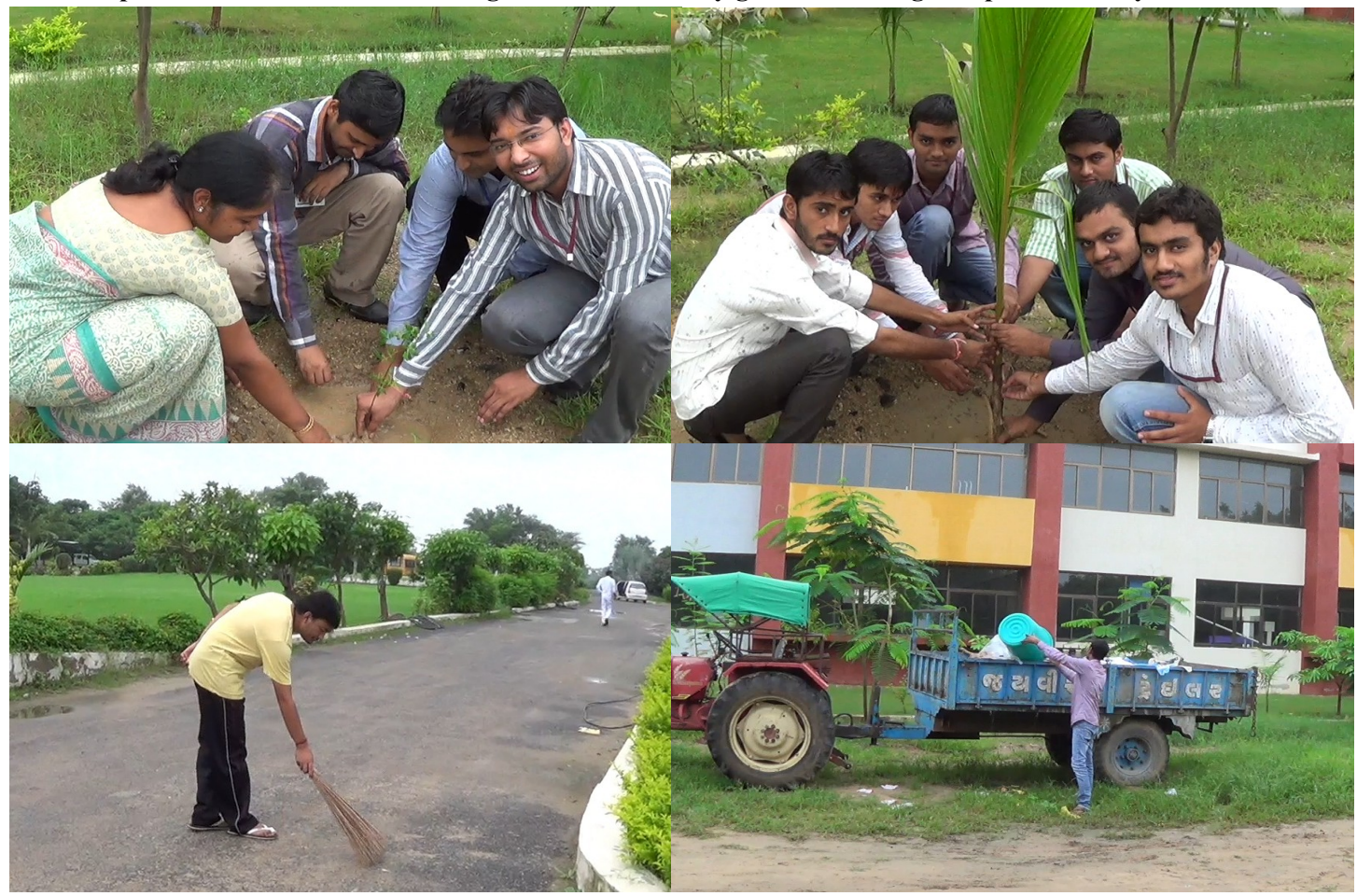
SRPEC Staff and Students during Tree Plantation and Campus Cleaning Drive on 15th August 2013