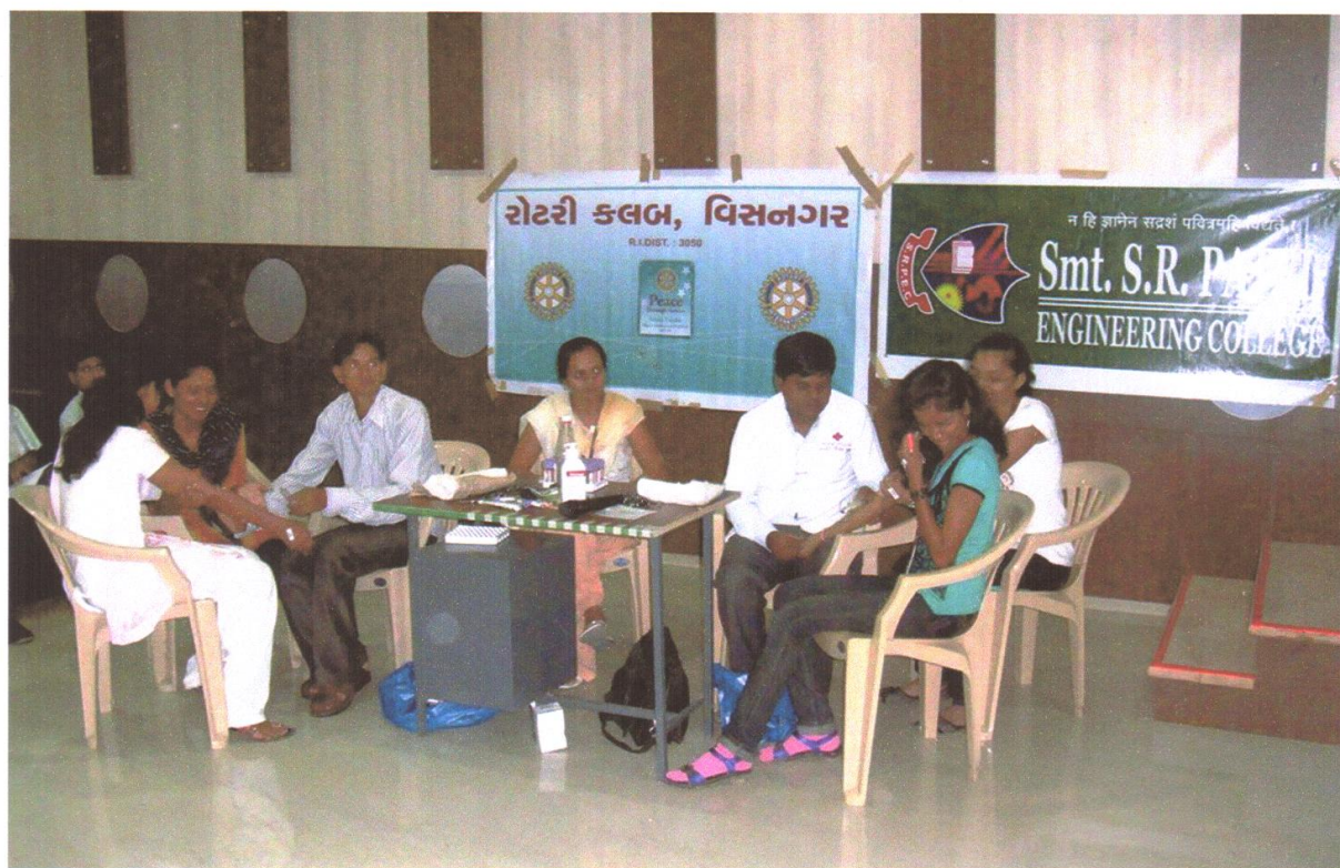
Collection of Blood Sample for Thalassemia and Hb Count Testing

Principal and senior lady-staff members regarding the awareness among the girls related to their health issues and particularly about the importance of Thalassemia and Hemoglobin count in the blood. A large number of girl students were present during the camp for getting their blood tested. Total number of 168 girls of various branches and semester and 9 female college staff provided their blood samples for testing. The whole event was well organized and controlled by the lady-faculties of the college and the Social-Accountability Club 'Yogdaan'. The camp was another evidence of the commendable efforts done by the college for all round development of their students and staffs and taking up regular measures of social cause.