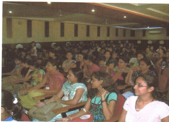
College Students Gathered for Blood Testing Against Thalassemia and Hb Count

ment. Prior to the organization of Thalassemia camp. The girl students were made aware about Thalassemia, its type and the effect of this blood—disorder in our life. The importance of Thalassemia testing was also elaborated as it is the only measure of preventing spreading of this disorder. An informative documentary was also shown to the girl-students on the day before the testing and during the camp. A counseling was provided by the