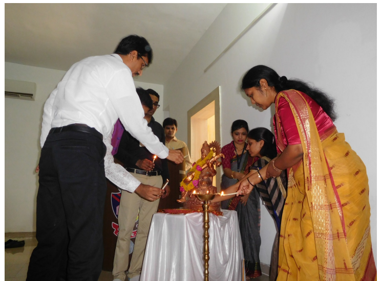
Inauguration of NCIET 2016 in presence of invited dignitaries

Different technical research papers were invited under four different tracks of Civil Engineering, Computer Engineering/ Information Technology and mechanical Engineering. The primary goal of the conference was to bring together the nationwide leading researchers, engineers and academicians interested together to exchange their